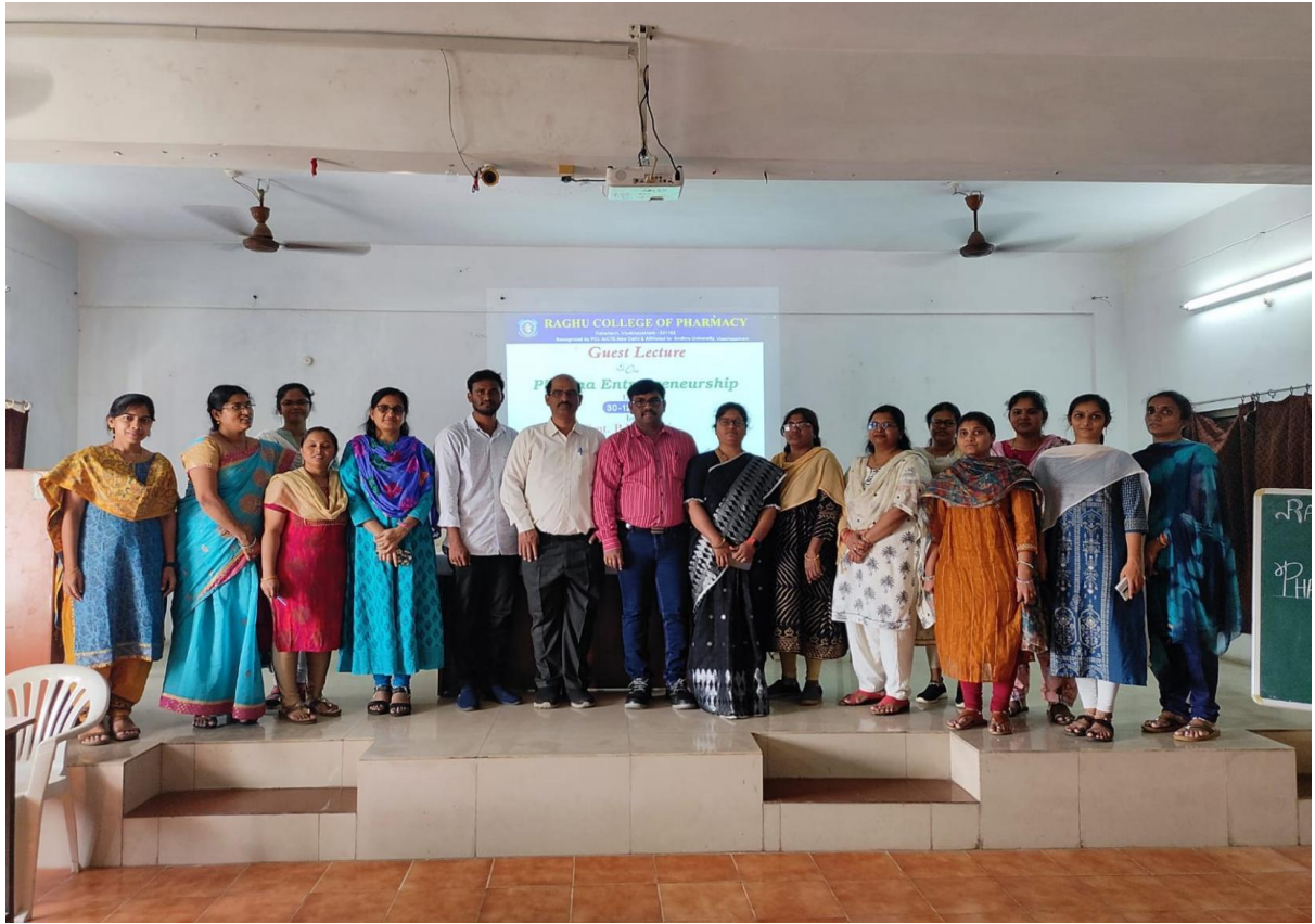
Photographic View of the poster